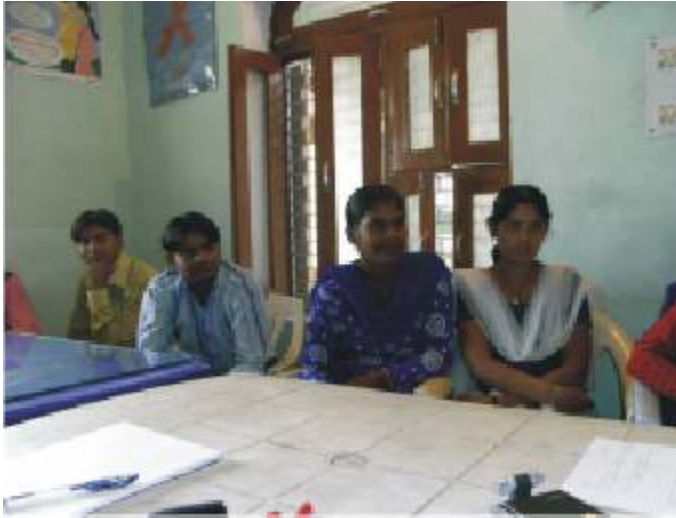
Peer educators in the Rewari district, Haryana.