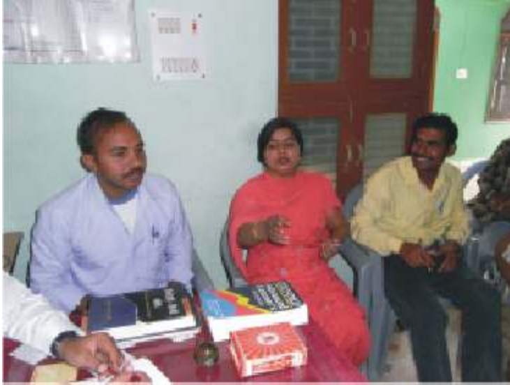
MAMTA community workers are training the peer educators in Bawal, Haryana.

“From the beginning I wondered to myself ‘how can I talk to other people about sex when I don’t do it with my own family?’”