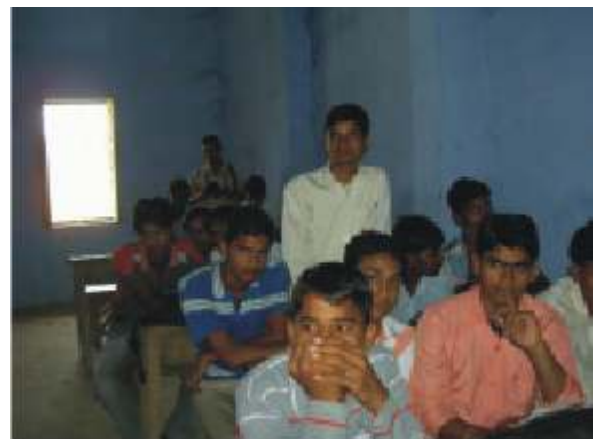
Boy class in Shree Surya Narayan Inter College in Pindra.