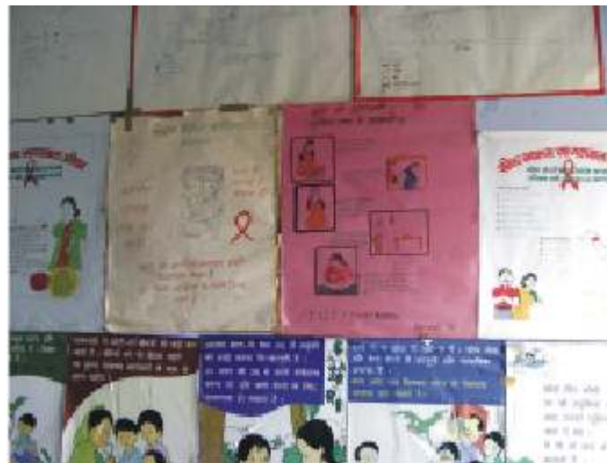
Messages concerning sexual health and rights on the wall in one YIC.

hours a month to talk sex – share good and bad. I think these are basic human health questions for everyone.