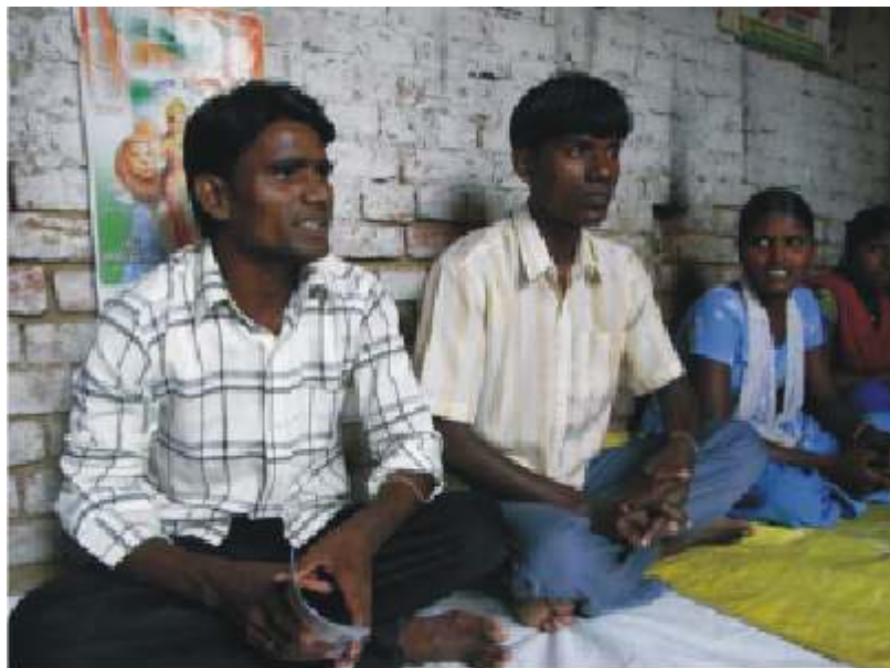
Young peer educators describing their work in the Pindra village.