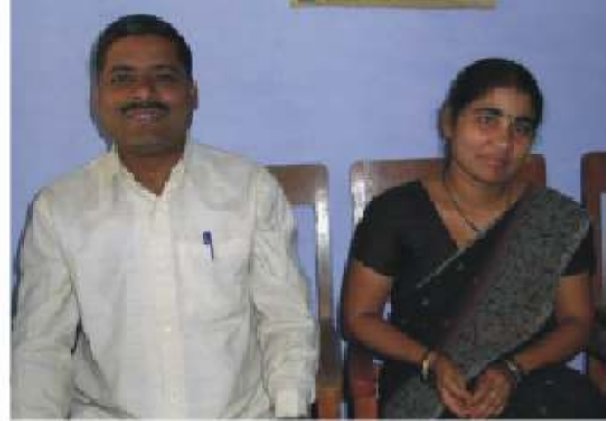
The open climate makes the questions easier to discuss.