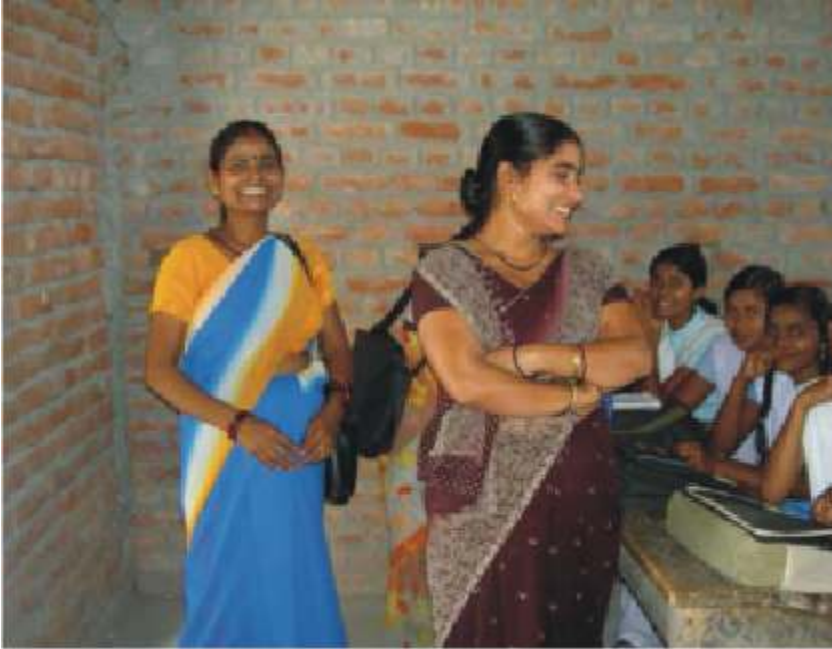
Teachers in a girl class, Pindra.

“Girls are more open than the boys now. It used to be the other way around.”